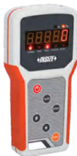
remote controller (included)