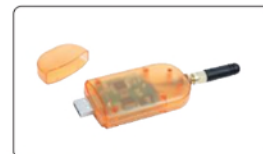
wireless receiver (optional)