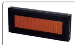
large display (optional)