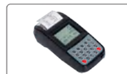
wireless printer (optional)